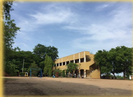
AVS @ 2016