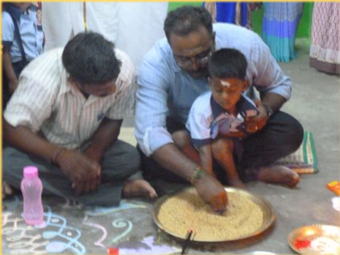
A student starting education by writing Tamil alphabet on rice paddy

As usual the children selection occurred during the summer holidays in April-May months. 30 children were selected (15 boys & 15 girls) for the lower kindergarten and also xx students admitted in other classes too. School started again after the summer holidays on 4th June with many great dreams and plans. Newly admitted children performed a special ceremony of "Vidyarambam". They sit on the laps of parents or teachers and written the first Tamil alphabet on rice paddy as a traditional custom here.