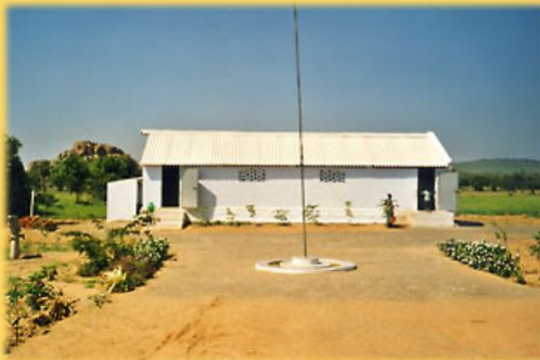
AVS @ 1999

AVS completed 17 years in the education field and so many students have completed their primary education so far. In these 17 years of educational services we have witnessed many great challenges but nothing stopped the enthusiasm in serving the children. Many lessons are learned every day, which made the school what it is today here!!!